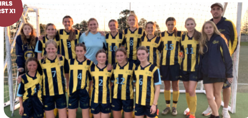
GIRLS FIRST XI

The girls First XI has huge potential; they are a very young squad which is predominantly a mixture of year 10 & 11 girls, combined with a few seniors and a year 9 girl. They put on a valiant performance against local rivals Westlake Girls in their first game of season. Coming away with a point in a 1-1 draw. Unfortunately, in the second game, St Cuthberts came away with all 3 points. However, the game was a great learning opportunity for the girls.