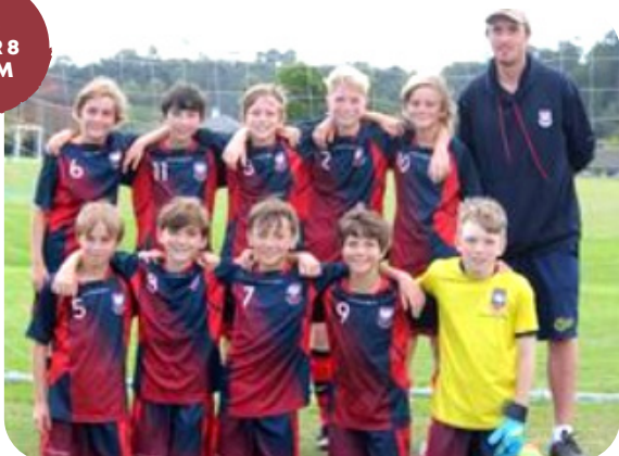
BIS YEAR 8 TEAM

The year 7 & year 8 boys have also played in the Football Zone Day in early May. Both year groups played some outstanding football with recognition of time and space. Special mention goes to the year 8 team which, at times, played complete total football! Dominating possession, moving the ball with purpose and scoring some spectacular team goals! They worked really hard and got all the way to the final to unfortunately lose 1-0 to Northcross. Photo below is of the year 8 team: